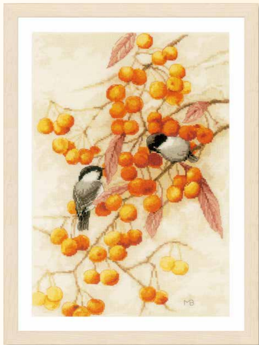
PN-0201746 ② ca. 28 x 43 cm - 11,2" x 17,2" ivory

craft of two hands'. Since those early years, generations of stitchers have kept this ancient craft alive and today, in the 21st century the long tradition of embroidery has been enriched with a new name: Lanarte.