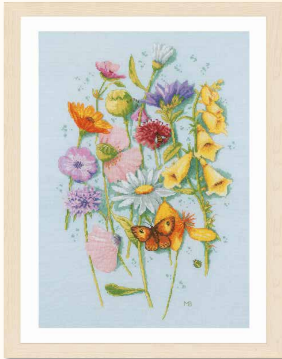
PN-0200466 □ ② ca. 34 x 52 cm - 13,6" x 20,8" light blue

craft of two hands'. Since those early years, generations of stitchers have this ancient craft alive and today, in the broiderie has been enriched with a new name: