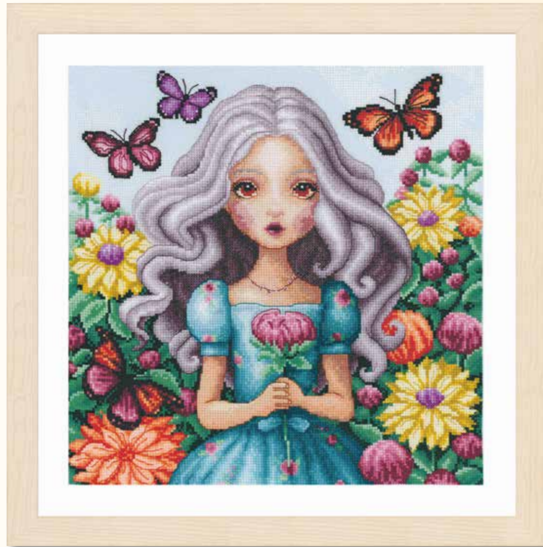
PN-0206839 □ © ④ ca. 29 x 29 cm - 11,6" x 11,6" light blue

craft of two hands'. Since those early years, generations of stitchers have kept this ancient craft alive and today, in the 21st century the long tradition of embroidery has been enriched with a new name: Lanarte.