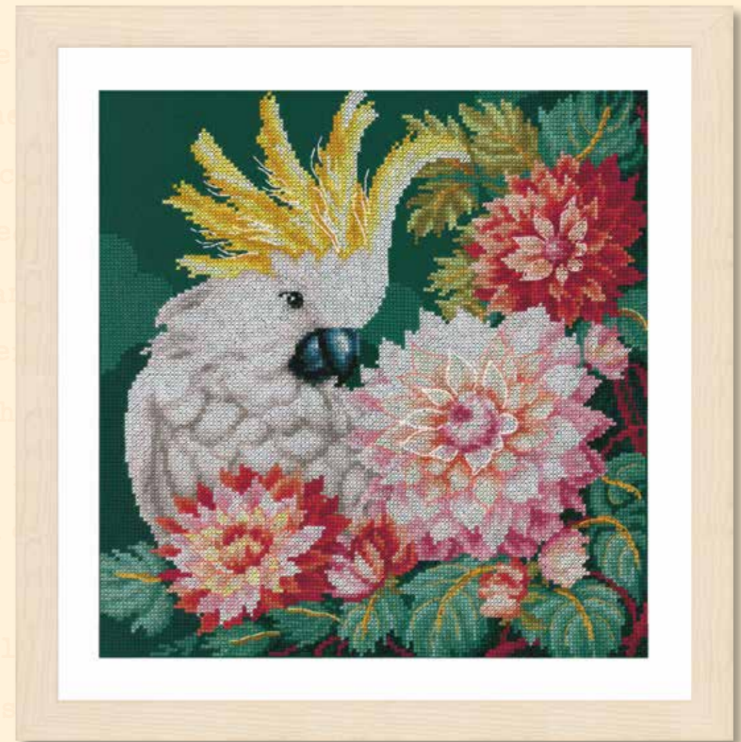
PN-0207167 ④ ca. 29 x 29 cm - 11,6" x 11,6" dark green