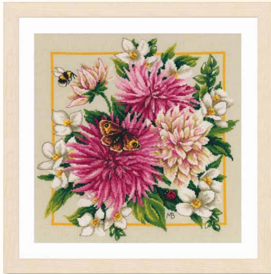
PN-0207467 ④ ca. 29 x 29 cm - 11,6" x 11,6" light brown

craft of two hands'. Since those early years, generations of stitchers have kept this ancient craft alive and today, in the 21st century the long tradition of embroidery has been enriched with a new name: Lanarte.