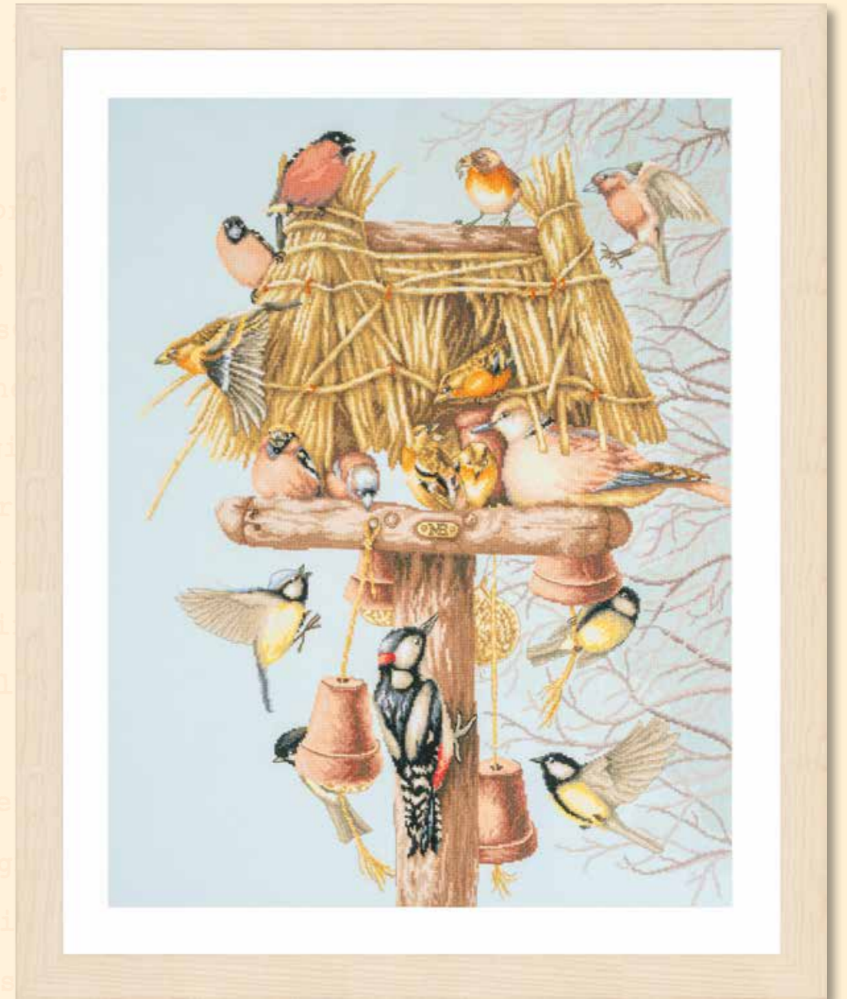
PN-0203363 □ ③ ca. 49 x 66 cm - 19,6" x 26,4" light blue