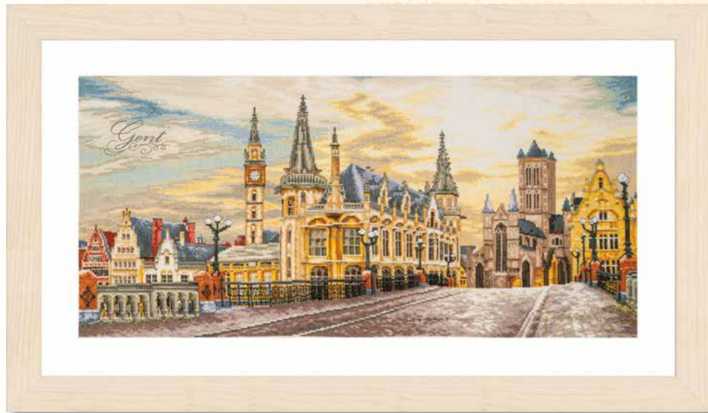
PN-0205236 4 ca. 70 x 35 cm - 28" x 14" ivory Available in 4 languages

craft of two hands'. Since those early years, generations of stitchers have this ancient craft alive and today, in the 21st century the long tradition has been enriched with a new name: Lanarte