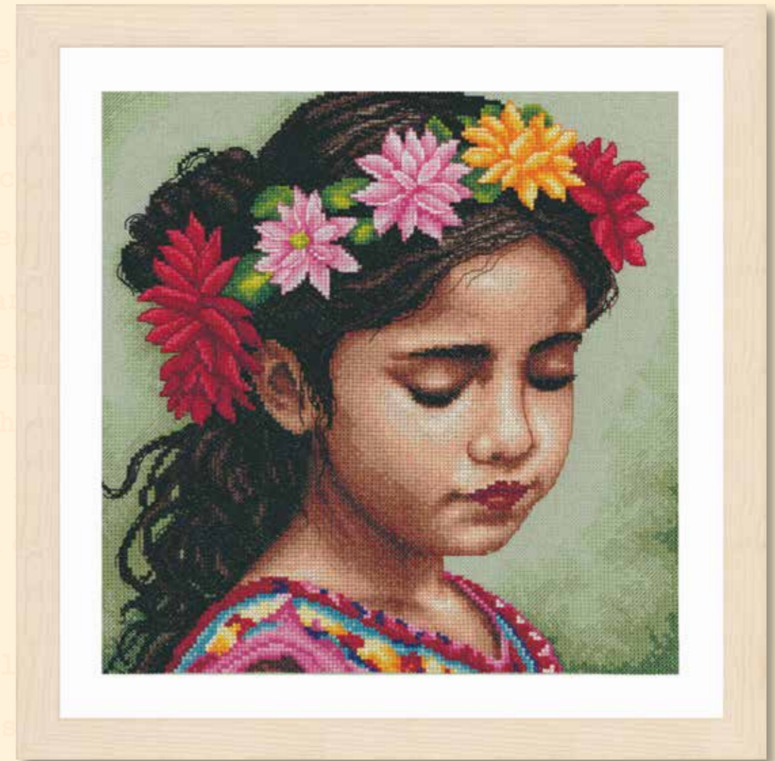
PN-0206850 ✦ © ④ ca. 29 x 29 cm - 11,6" x 11,6" green