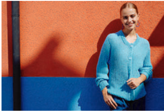
CRUISE LIDO & LAGOON