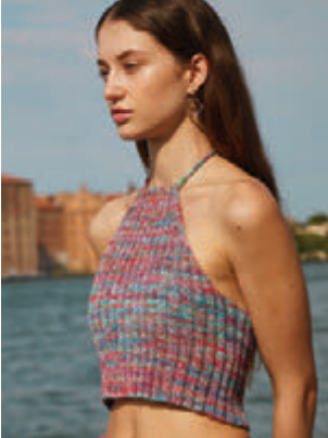
020 • TOPDOWN