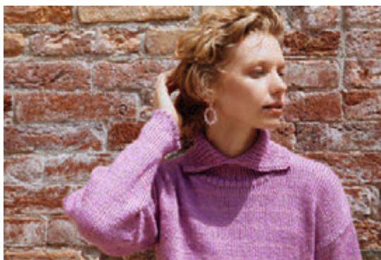
STROLL OLEANDER & BOUGAINVILLEA