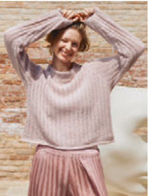
028 • TOPDOWN