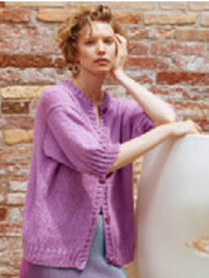
025 • TOPDOWN