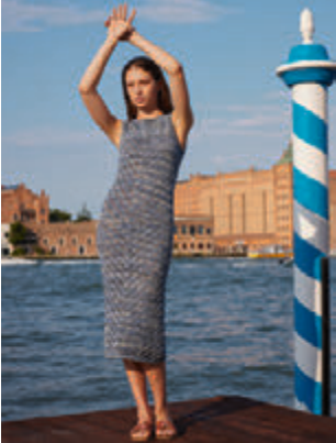
017 • TOPDOWN

45% cotton | 42% virgin wool | 13% polyamide 400m | 100g NN 2.5-3.5