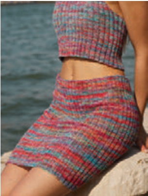
021 • TOPDOWN