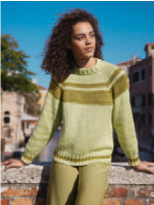
009 • TOPDOWN