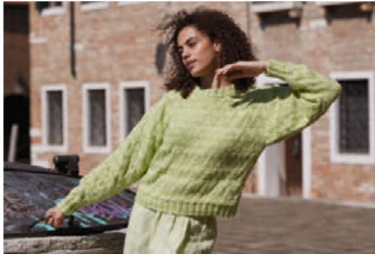
SAVOUR PISTACHIO & ARTICHOKE