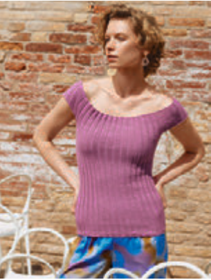
030 • TOPDOWN