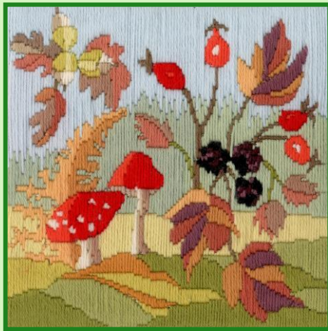
Autumn ref LSS03 20x20cm