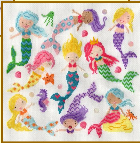
Slightly Dotty Mermaids ref XEJ9 26x26cm