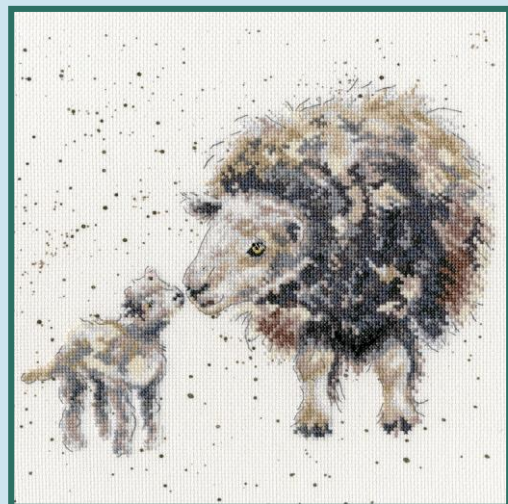
Ewe And Me ref XHD47 26x26cm