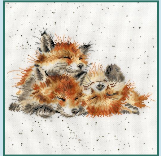
Afternoon Nap ref XHD45 26x26cm