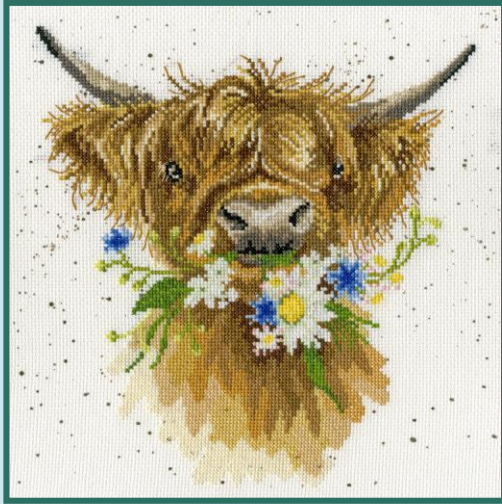
Daisy Coo ref XHD42 26x26cm