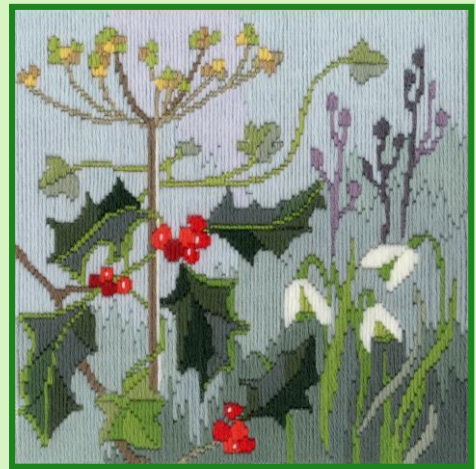
Winter ref LSS04 20x20cm

The Twelve Days of Christmas brings our year to a festive finish - Happy Christmas!