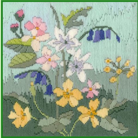
Spring ref LSS01 20x20cm

Four new long stitch designs by Rose Swalwell