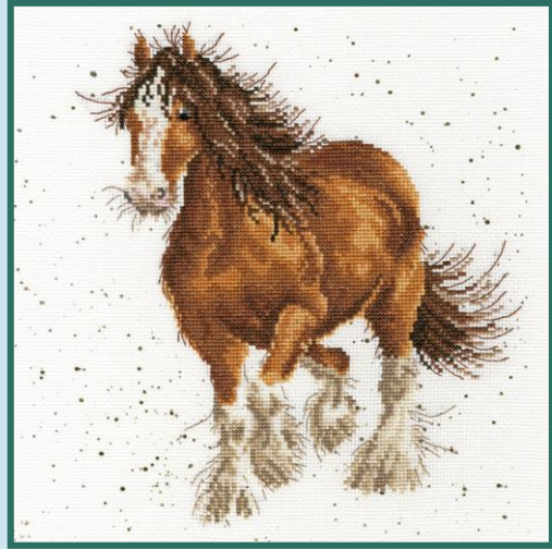
Feathers ref XHD43 26x26cm