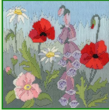
Summer ref LSS02 20x20cm