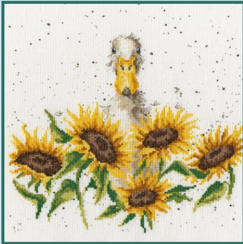
Sunshine ref XHD44 26x26cm