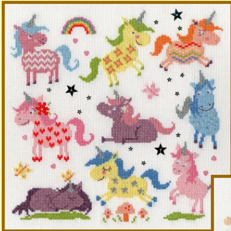
Slightly Dotty Unicorns ref XEJ7 26x26cm