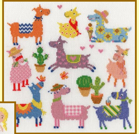
Slightly Dotty Llamas ref XEJ8 26x26cm