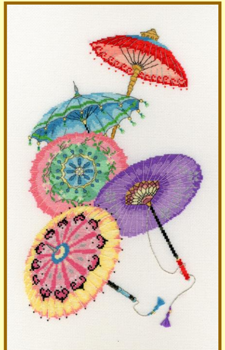
Parasols ref XKF1 22x36cm