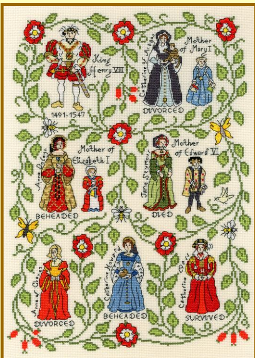
Henry VIII ref XPS7 27x38cm