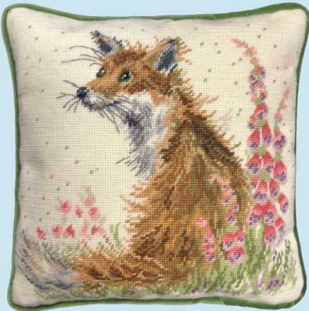
Amongst The Foxgloves ref THD8 36x36cm

Four new tapestry kits on 10hpi full colour printed canvas