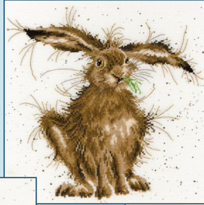
Hare Brained ref XHD49 26x26cm