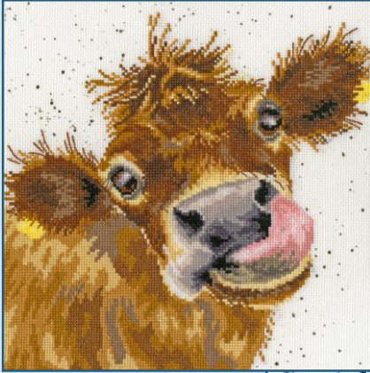
Moo ref XHD48 26x26cm