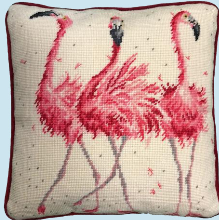
Pink Ladies ref THD24 36x36cm