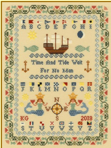
Time And Tide ref XBD5 27 x 36cm