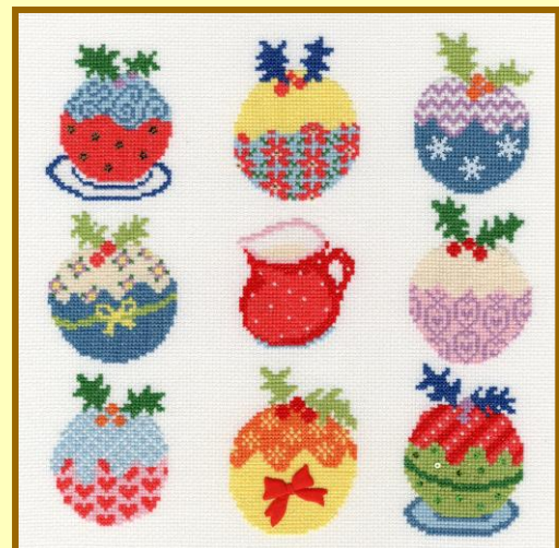
Slightly Dotty Xmas Puds ref XEJ6 26 x 26cm