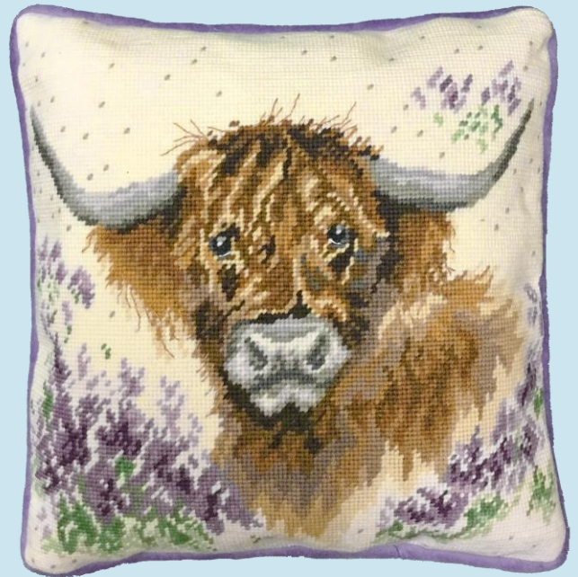
Highland Heathers ref THD9 36 x 36cm