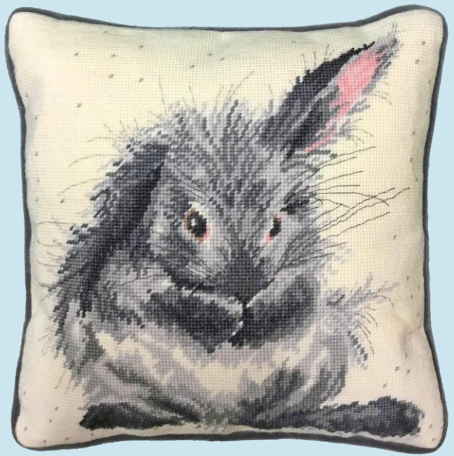
Bath Time ref THD16 36 x 36cm