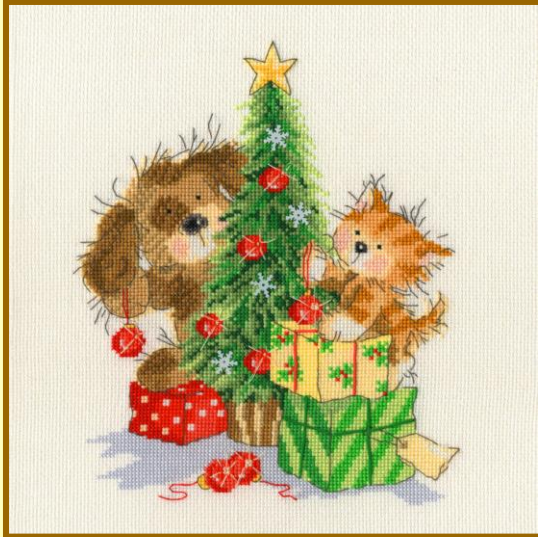
Decorating The Tree ref XX13 26 x 26cm

New Christmas designs including three new Christmas Cards all on 14hpi Aida.