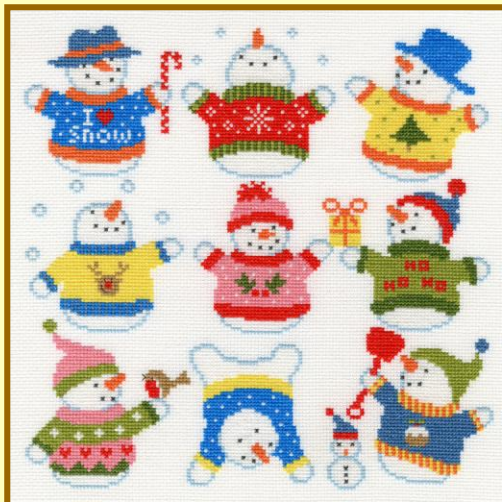
Slightly Dotty Snowmen ref XEJ5 26 x 26cm