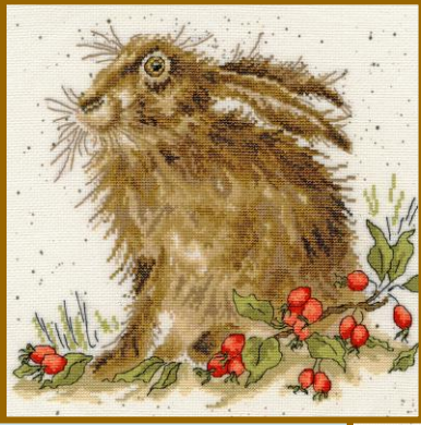
Hippy Hare ref XHD38 26 x 26cm