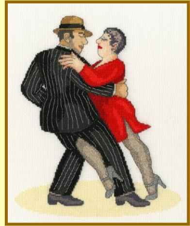
It Takes Two To Tango