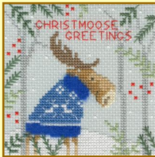
Xmas Moose ref XMAS7 10 x 10cm