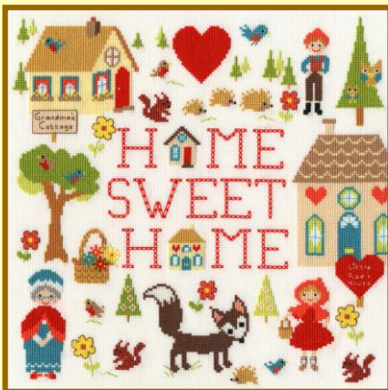
Home Is Where The Heart Is ref XMG1 26 x 26cm