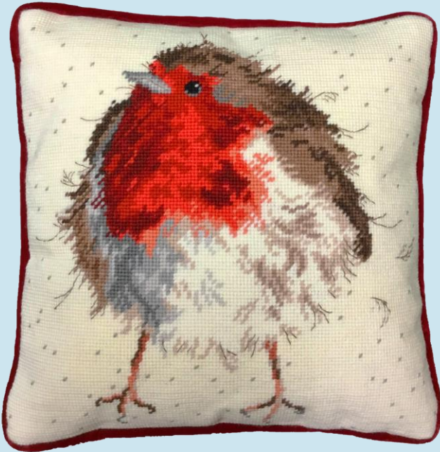
Jolly Robin ref THD5 36 x 36cm