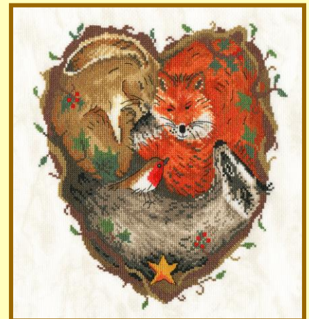
Heart of the Woodland ref XSR3 26 x 28cm