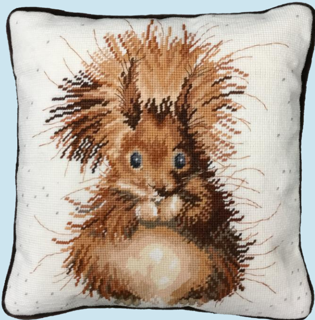
The Nutcracker ref THD14 36 x 36cm