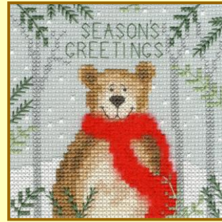
Xmas Bear ref XMAS9 10 x 10cm