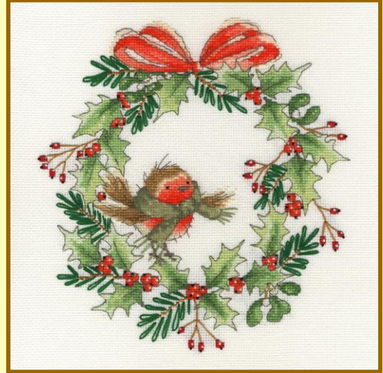
Robin Wreath ref XX14 26 x 26cm