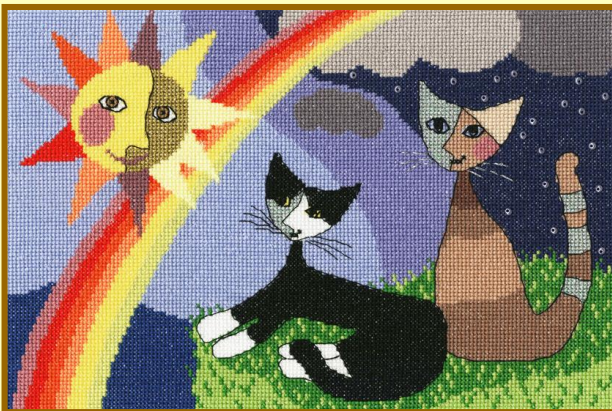
After The Storm