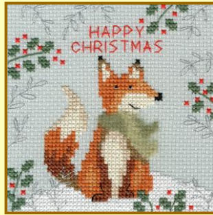
Xmas Fox ref XMAS8 10 x 10cm