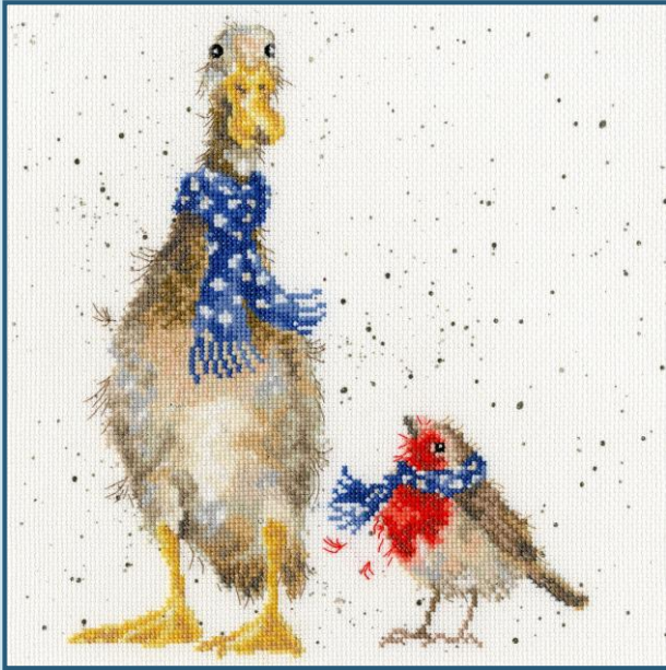
Christmas Scarves ref XHD54 26x26cm