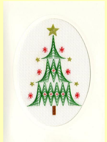
Christmas Tree ref XMAS24 9x13cm