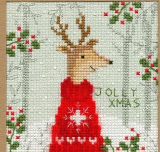
Xmas Deer ref XMAS12 10x10cm