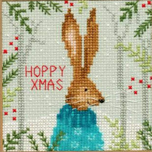
Xmas Hare ref XMAS10 10x10cm