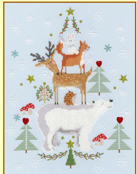
Snowy Stack ref XX16 19x29cm