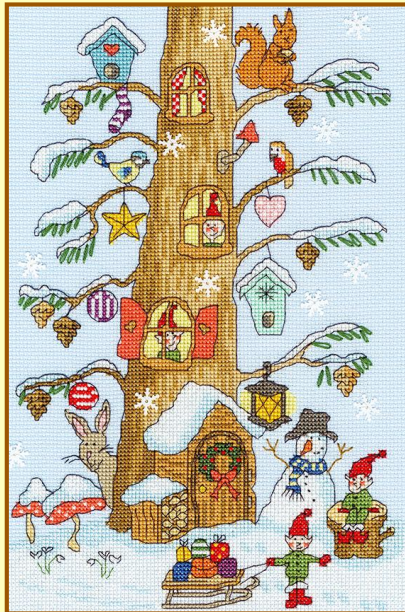
Santa's Little Helpers ref XX15 19x29cm