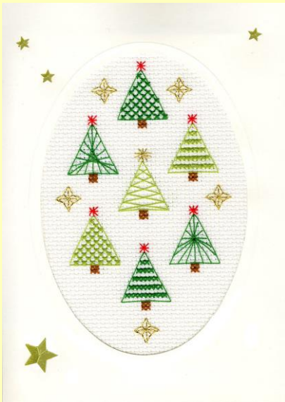
Christmas Forest ref XMAS23 9x13cm