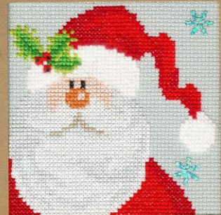
Snowy Santa ref XMAS15 10x10cm