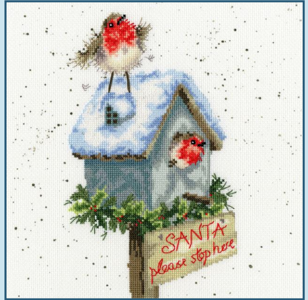
Santa Please Stop Here ref XHD55 26x26cm