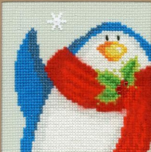
Snowy Penguin ref XMAS13 10x10cm