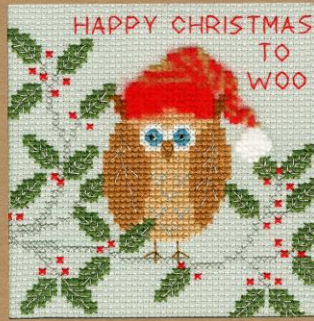
Xmas Owl ref XMAS11 10x10cm