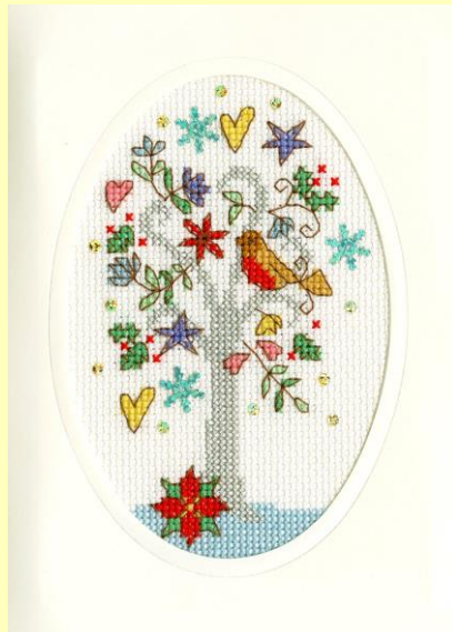
Winter Wishes ref XMAS22 9x13cm