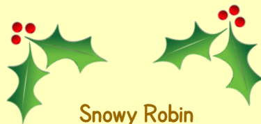
Snowy Robin ref XMAS14 10x10cm