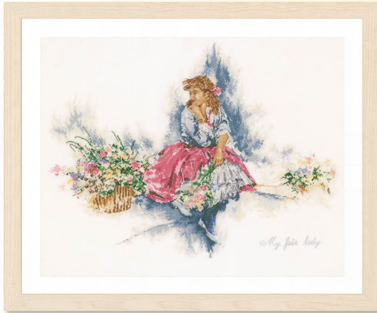
PN-0182405 P ca. 54x43 cm - 21,6" x 17,2"