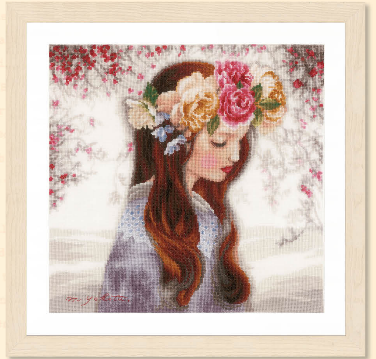
PN-0184498 P ca. 32x32 cm - 12,8" x 12,8"