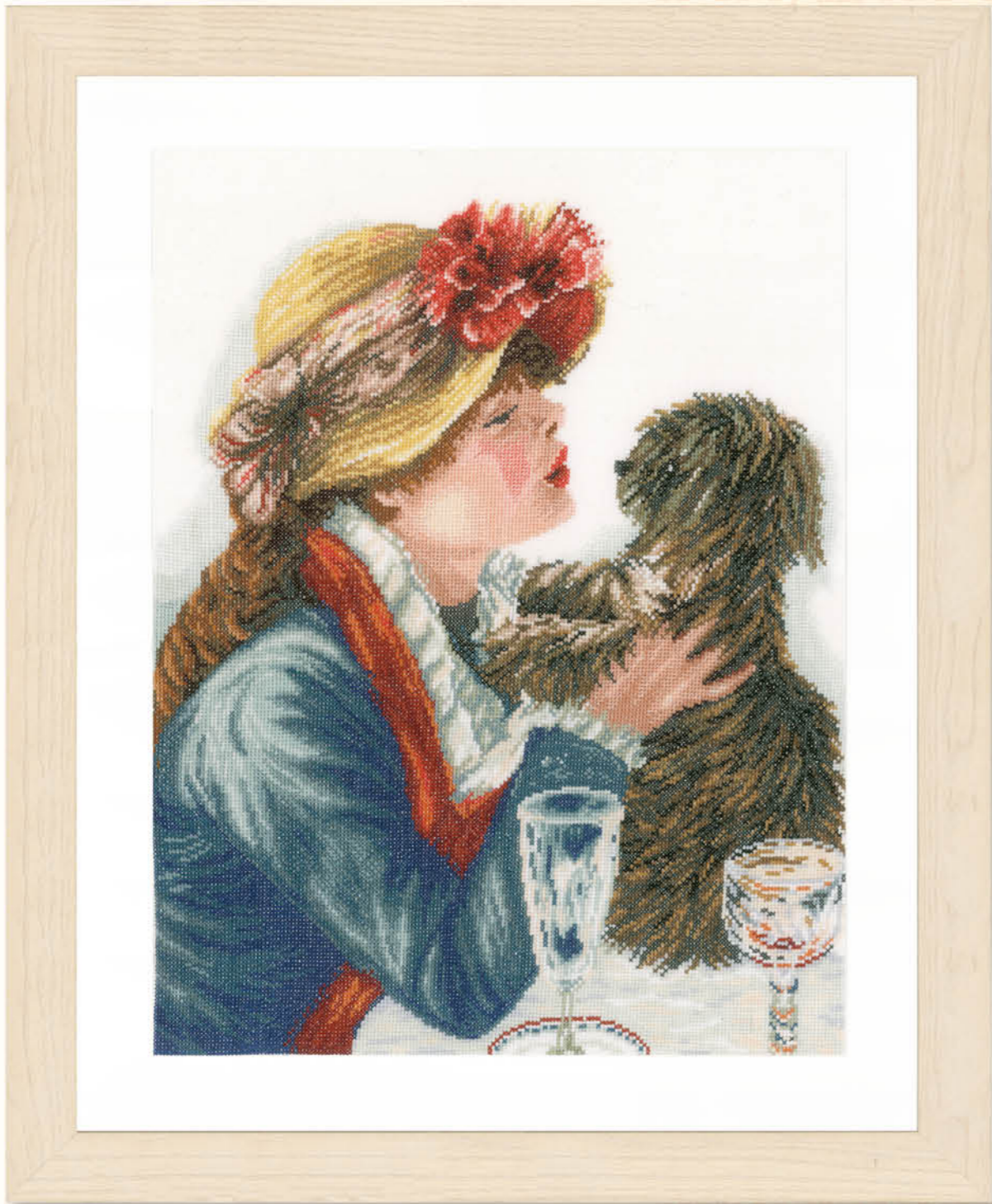
PN-0168607 P ca. 34x40 cm - 13,6" x 16"

The 17th century Turkish traveler, Evliya Celebi, described the 'craft of two hands'. Since those early years, generations of artists have kept this ancient craft alive and today, in the 21st century the long tradition of embroidery has been enriched with a new name: Lanarte.