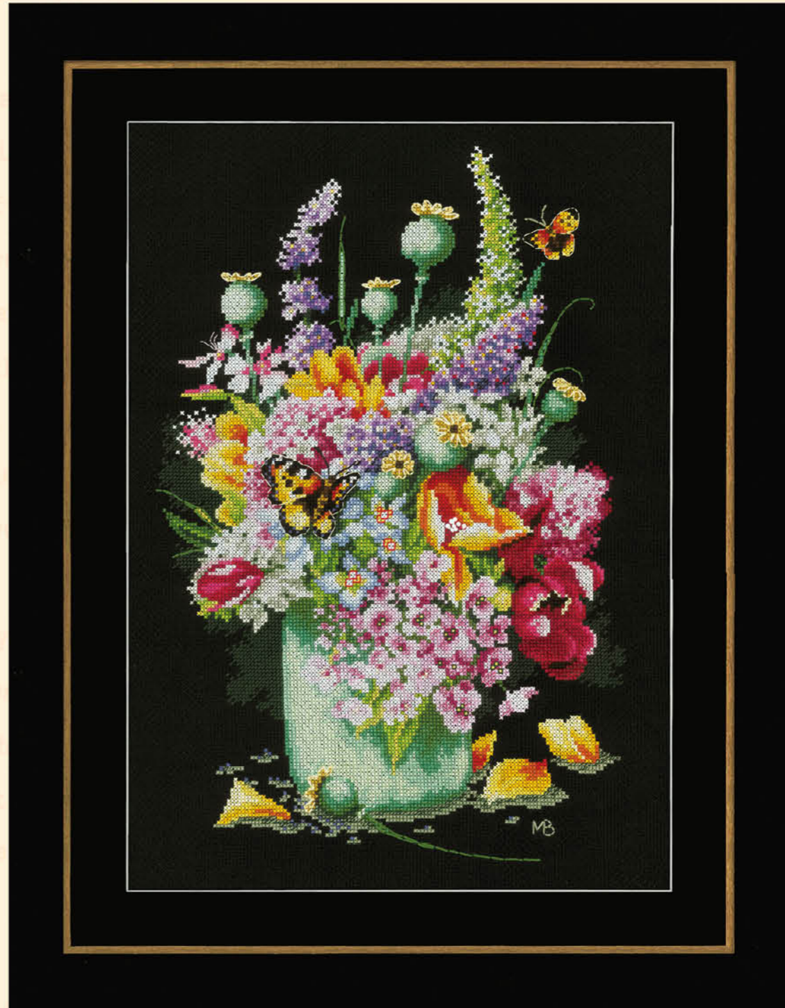
PN-0183477 AE ca. 27 x 39 cm - 10,8" x 15,6"