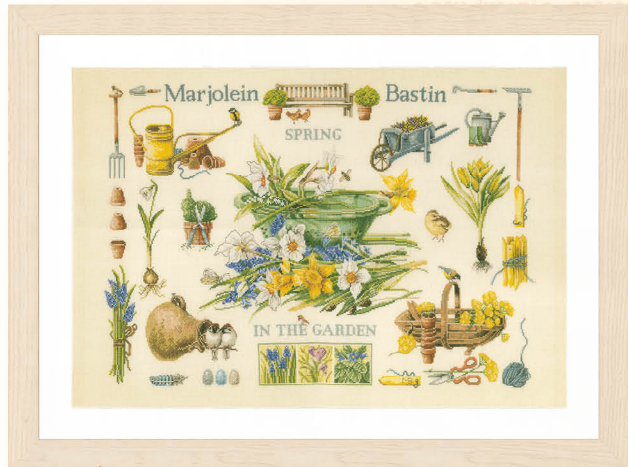
PN-0007964 S ca. 69 x 49 cm - 27,6" x 19,6"