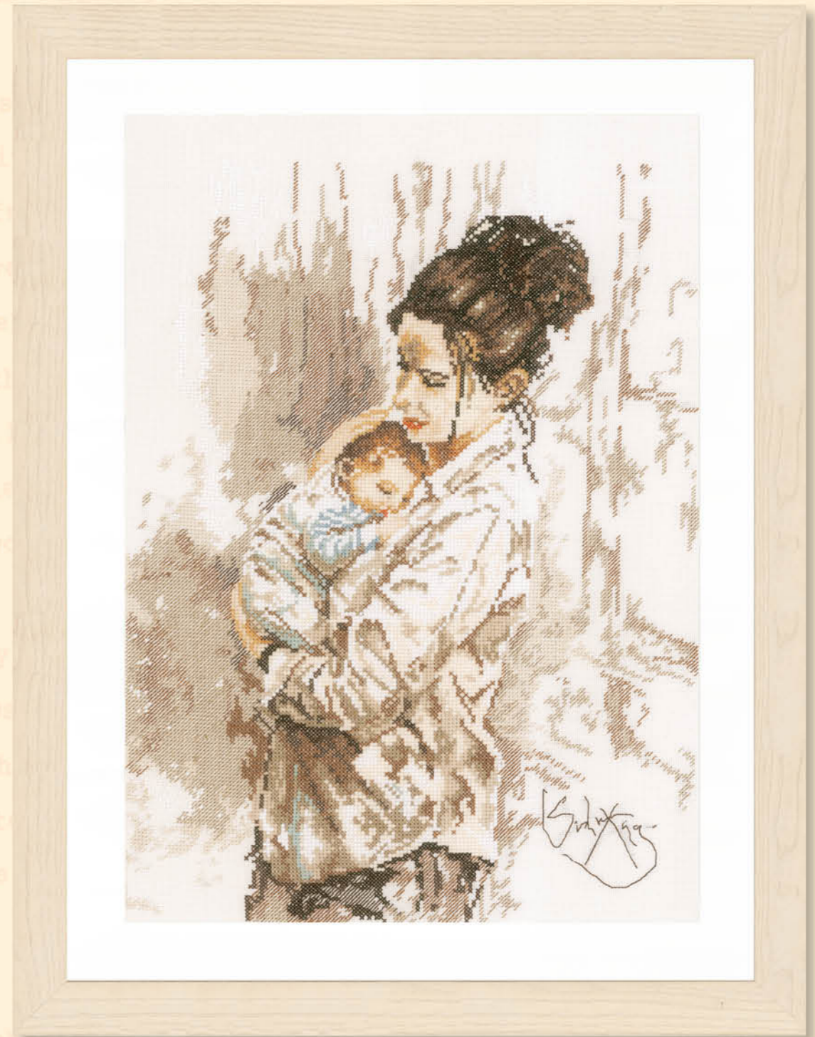
PN-0008047 S ca. 29x39 cm - 11,6" x 15,6"

© "Luncheon of the Boating Party" by Pierre-Auguste Renoir